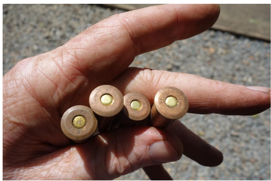
Figure XVII: Sample of 7.62x52Rmm ammunition