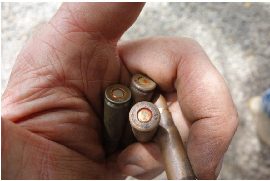
Figure XVI: Sample of 7.62x39mm ammunition