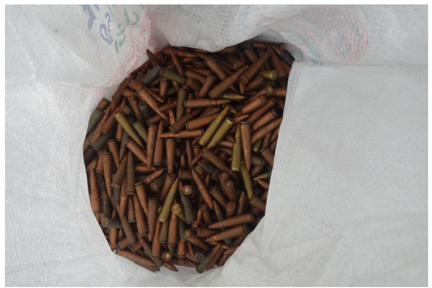
Figure XV: Rounds of 7.62mm ammunition seized by UNMISS in July 2016

The Panel also examined the more than 3,000 rounds of ammunition also seized by UNMISS in July 2016. However, given the time available and the number of rounds and diversity of the sources of manufacture, it was not possible to document every piece of ammunition. As the rounds are without their packaging, tracing them to their first consignee is impossible. Nevertheless, the examination indicates that none of the ammunition was manufactured after 2015.