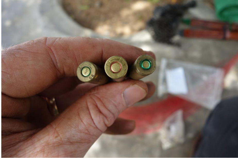
Figure XVIII: Sample of 5.56mm ammunition