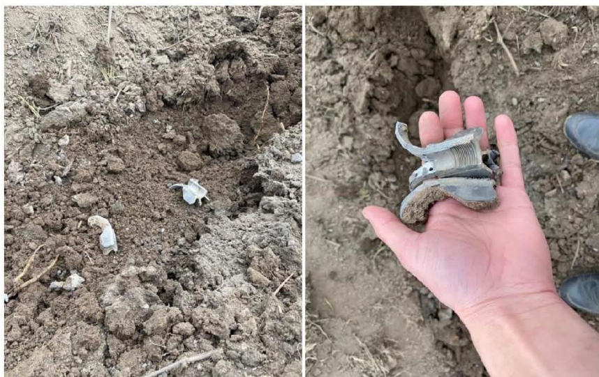
Image 4 . Ammunition remains in a vineyard in Khamort community