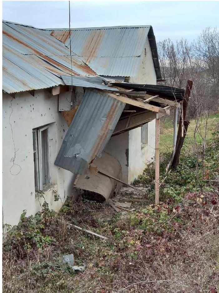
Image 2 . Damaged community building in Parukh village

March 11, 2022 - 7 projectiles exploded in the direction of Parukh village of Askeran region between 12:00-19:00.