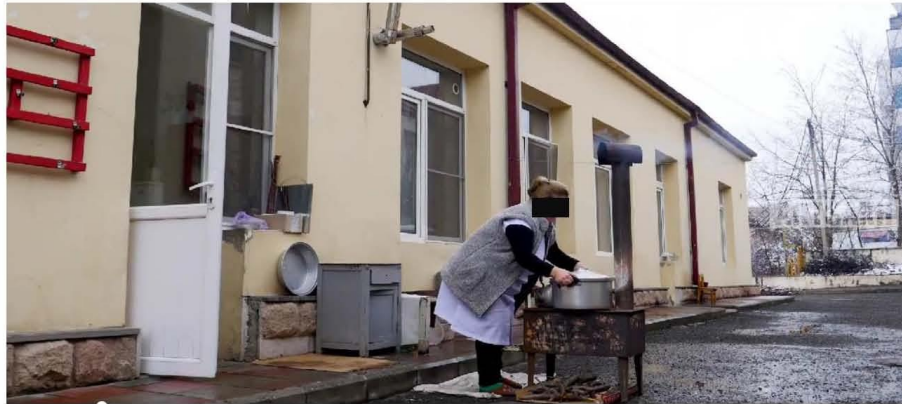
Image 6. The process of food preparation in one of the kindergartens of Stepanakert

process of organizing and delivering children's food in kindergartens. The staff has to use wood and electric stoves installed outside for cooking 6 .