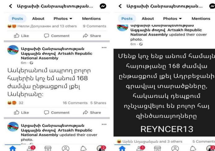
Image 7. The official Facebook page of the National Assembly of the Republic of Artsakh after cyber attack

The Picture 7 shows the terrorist statement spread by them on the official Facebook page of the Artsakh Republic National Assembly during the period under their control, urging the Armenians to leave the "occupied territories of Azerbaijan, otherwise all Armenian servicemen will be killed."