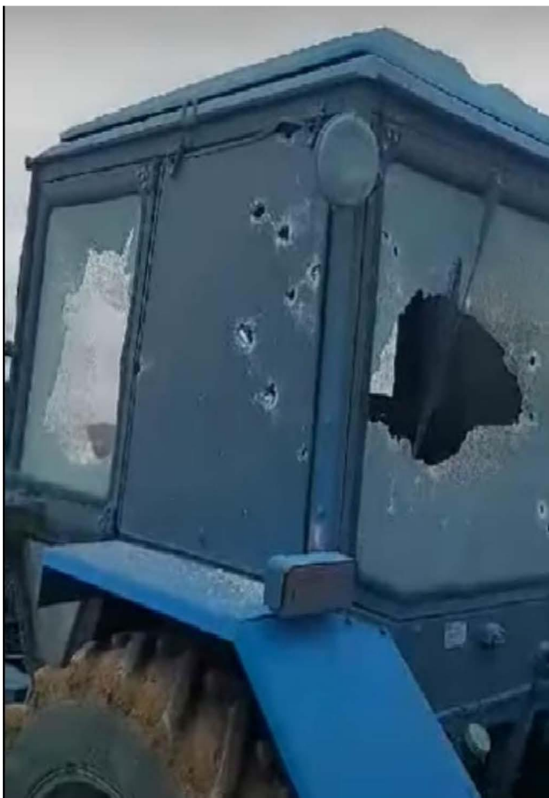
Image 3 . Damaged tractor in Nakhichejanik village