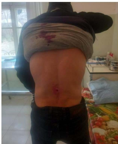
Image 5 . Injured civilian in Khamort