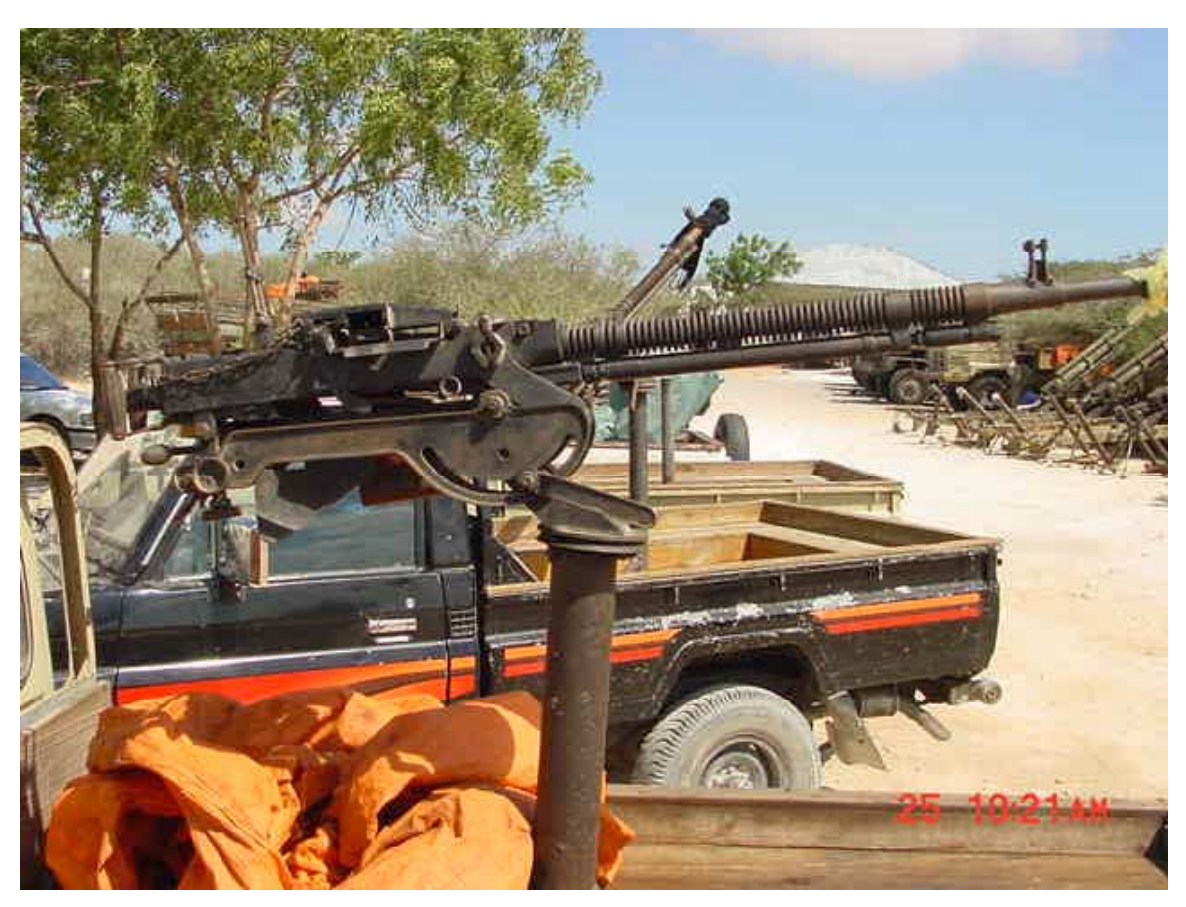
DSHK heavy machine gun mounted on a pick-up truck (other weapons in the background)