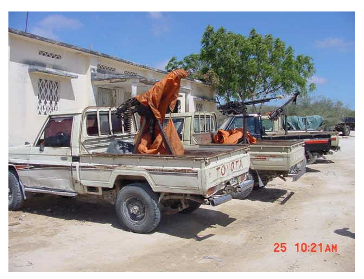
Pick-up trucks mounted with heavy machine guns and anti-aircraft weapons, better known as "technicals"

and ammunition from the arms market in Mogadishu and from officers of other factions.<sup>5</sup>