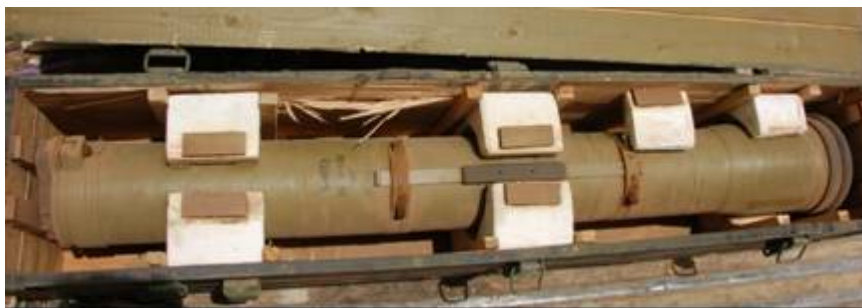
9M113 anti-tank guided missile system