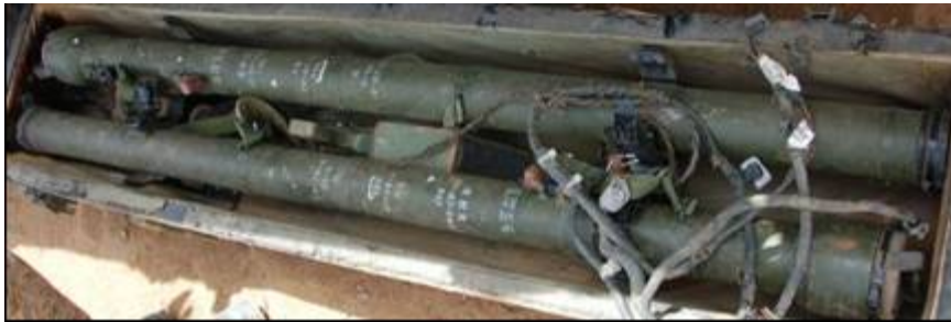
Photo 10 9M14M anti-tank guided missile