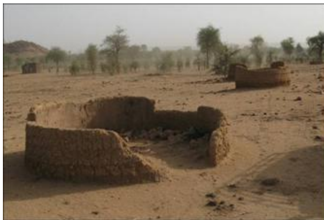
A destroyed Birgid village in August 2008

51. According to confidential interlocutors in the region, after those incidents the situation became calm to the point where many World Food Programme (WFP) and the Office of the United Nations High Commissioner for Refugees (UNHCR) missions could be carried out without armed patrols in the southern part of West Darfur. However, violence erupted in December 2008 in the Mukjar market when internally displaced persons burned down dozens of stores that were operated by their own women, and looted the local UNHCR compound.