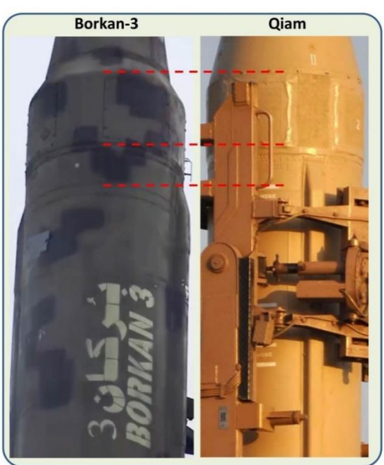
Similarity of Borkan-3 and Qiam "short" guidance sections