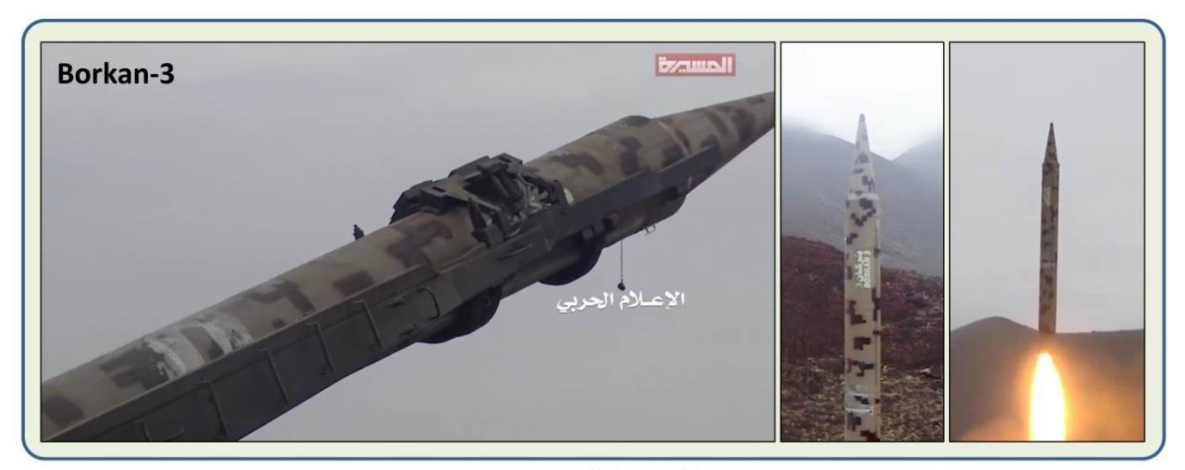
Borkan-3 launch video